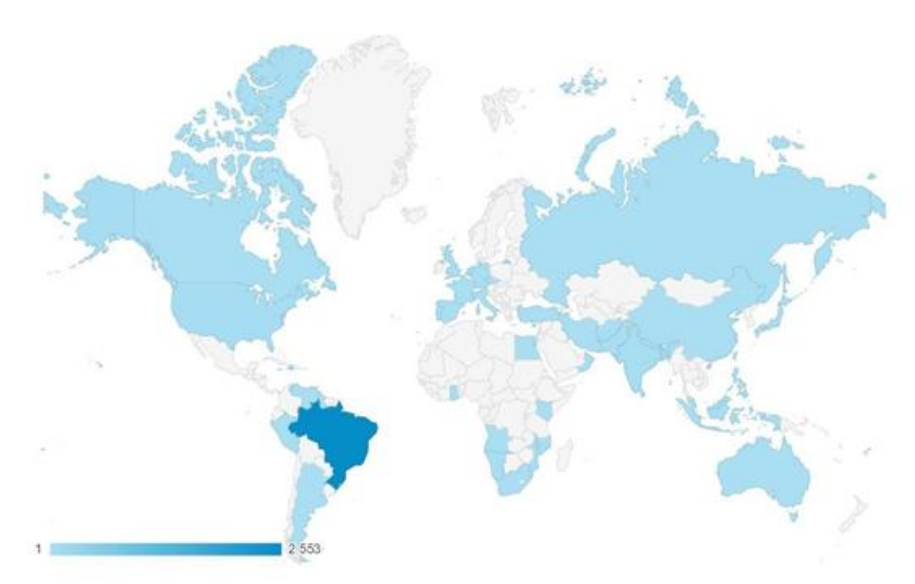
Figure 4: The Virtual Museum around the world

inside the Museum; responses of the characters as devolutive to the interacting subjects; a more practical solution to the plug and play issue; to place all the dialogues of the Virtual Museum (texts) in a second language, preferably in the English language, so that there is a greater interaction and interactivity on the part of the internauts around the world; a better resolution of answers so that operating systems can "run" the Virtual Museum, São João da Bahia Theater, by at least 90%, punctuating the mishaps discouraged Internet users downloading and navigating the Museum; the impossibility, at this moment, of the subjects and users to be able to see the course and to create collaborations from the interactions and interactivities within the Virtual Museum itself, that is, a more dynamic collaboration system; and so many other details that could be listed here in this closing analysis.