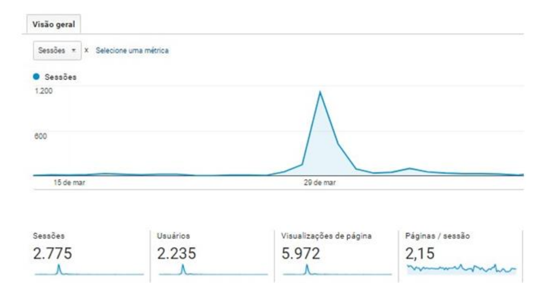
Figure 3: Overview, period from March 13 to May 12, 2017. (Overview all cycles, application)

partnerships of the 1st and 2nd applications, since we work with practical solutions and cycles (processes) in which we will always be giving feedback. So, for the 3rd cycle, 3rd application, which, for reasons of didactics and science, has not been deepened here in its analyzes, we already have the access of 340 users, with 975 page views, 296 in Brazil and 628 outside it (Figure 3).