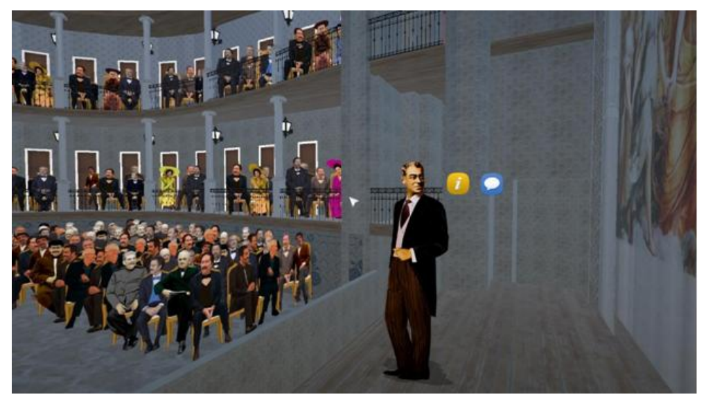
Screenshot 2: Virtual Museum, São João da Bahia Theater, screenshot, internal ambience.

Therefore, when opening this first application, for analysis and authentication of the Virtual Museum São João da Bahia Theater already modeled (Screenshot 1 & 2).