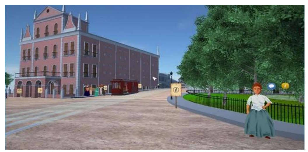
Screenshot 1: Virtual Museum, São João da Bahia Theater, screenshot, external environment.

(free program in which the user is allowed to register and mark their data through possible tools available in their environment), which, in turn, generated the graphs that gave us parameters for analysis from the visits and interactions of the subjects and internauts to the São João da Bahia virtual museum,